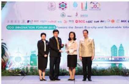
ESIE receives Eco Industrial Town Award

For the fifth consecutive year, Eastern Seaboard Industrial Estate (Rayong) (ESIE), developed by WHA Industrial Development PLC received an Eco Industrial Town Award in the Eco-Champion category. The Eco Innovation Forum 2018 Toward the Smart Eco-city and Sustainable Urbanization was co-organized by the Digital Economy and Society Ministry, the Industry Ministry and the Federation of Thai